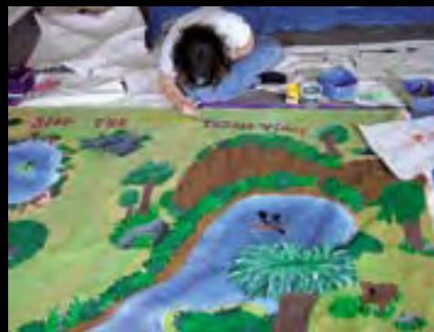
Left and Below: Participants creating the mural.