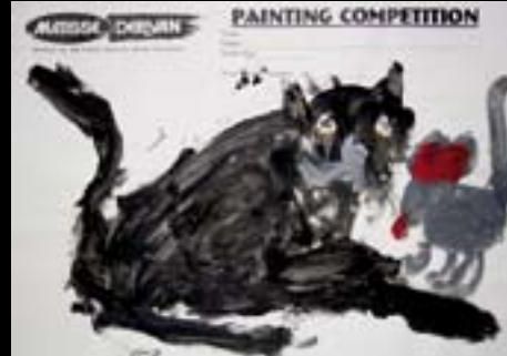
Left: Runner up 4 to 7 years - Sienna, aged 6.