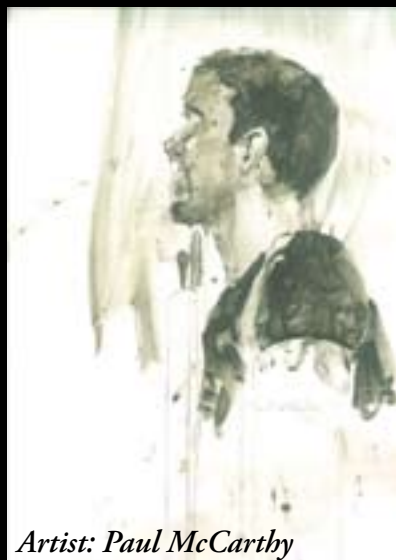
Artist: Paul McCarthy