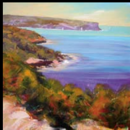
North Head from Middle Harbour