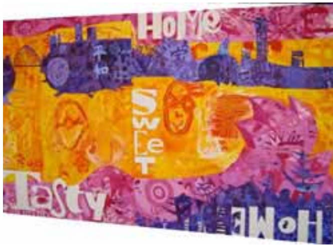
Above: Part of 'The Tube' painted at the Sydney Esquisse.

presented at an auction revealing a piece of contemporary art composed by hundreds of Sydneysiders.